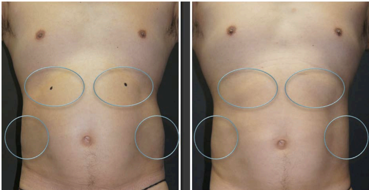
Figure 1. Left lateral abdominal before (upper left image) and 4-months after 1 treatment session (upper right image). Right lateral abdomen is the control side (untreated). Upper abdomen: right (4-months post first treatment) and left (2-months post second treatment).

The subject demographics were: 6 females and 2 males, age range: 36 – 60 years old (mean: 46.8 years old). One subject was excluded from the study because of an unrelated traumatic injury to the shoulder requiring surgery. Of the 7 subjects, a total of 13 sites were treated: 3 subjects requested treatment at 2 body sites, 2 subjects had 1 site treated, and 1 subject had 4 sites treated. The lateral abdomen was the most commonly nominated site (figure 1). The specified measurements were done at baseline, 2-months and 4-months post-treatment (table 1).