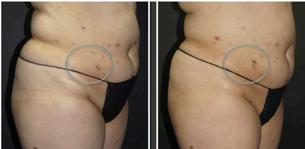
Figure 4. Right lower lateral oblique abdomen before (left image) and 2-months after 1 treatment session (right image).

Our pilot study on various methods of tracking fat reduction favour standardised photography and ultrasound over callipers and circumferential tape measure. Circumferential tape measurement of abdominal girth is unlikely to be reliable given the limited target area in the context of the much larger truncal girth, which expands and contracts with the breathing cycle. We were unable to demonstrate consistency with calliper measurements of skin fold thickness, which can be pinch- and pressure- sensitive and prone to early user-error. Photography performs well on reliability, familiarity and accessibility, and furthermore, allows meaningful before-after comparison for patients. The anterior (front-on) and side (lateral) profile views are particularly useful to demonstrate contour changes. Oblique views may not highlight contour changes adequately and this was highlighted by one patient who was uncertain about the outcome and remained unconvinced on review of post-treatment oblique photos despite a 26.9% fat thickness reduction on ultrasound (figure 4). This case illustrates how improper patient selection (high body mass index) and site selection (non-obvious fat bulge) can lead to patient dissatisfaction.